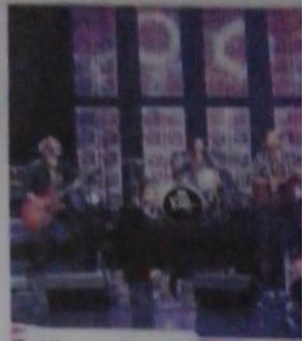
Kings of Leon