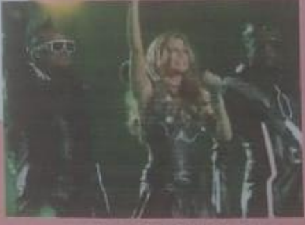
a on stage with the Black Eyed Peas

A Read the article. Then number these sentences from 1 (first event) to 8 (last event).