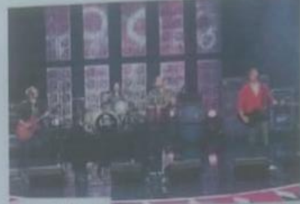
Kings of Lean