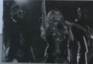
▶ on stage with the Black Eyed Peas

A Read the article. Then number these sentences from 1 (first event) to 8 (last event).