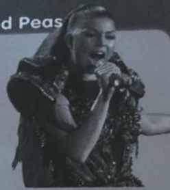
▶ performing at the World Cup

Fergie says she's the "luckiest girl in the world." Why? Her song "Glamorous" says it all: "All the fans, I'd like to thank. Thank you really though, 'cause I remember yesterday when I dreamed about the days when I'd rock on MTV..."