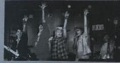
▶ on the TV show Kids Incorporated