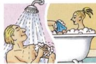
13. take a shower / a bath