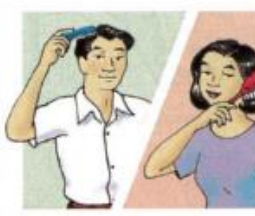
4. comb / brush my hair