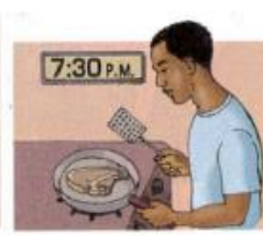
9. make dinner