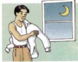
12. get undressed