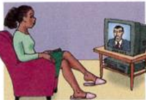
11. watch TV