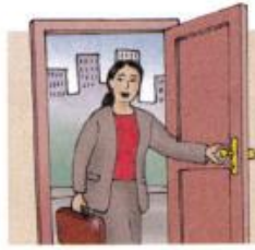
8. come home