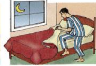
14. go to bed