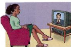
11. watch TV