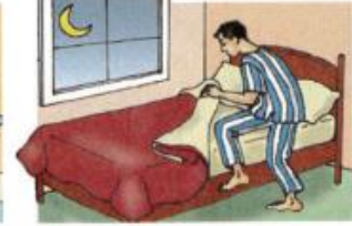
14. go to bed