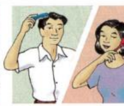
4. comb / brush my hair