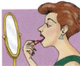
6. put on makeup