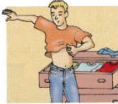
2. get dressed