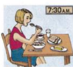
7. eat breakfast