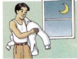
12. get undressed