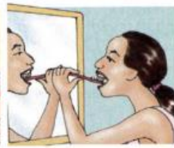
3. brush my teeth