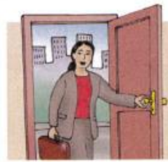
8. come home