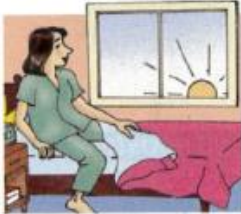
1. get up