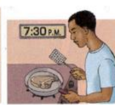
9. make dinner