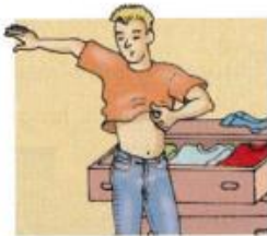
2. get dressed