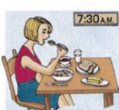
7. eat breakfast