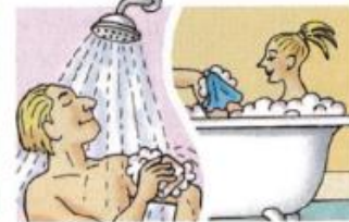
13. take a shower / a bath