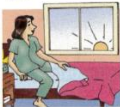
1. get up