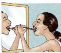
3. brush my teeth