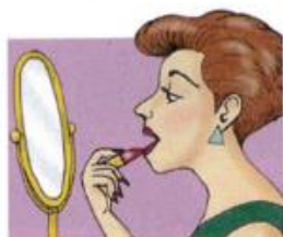
6. put on makeup