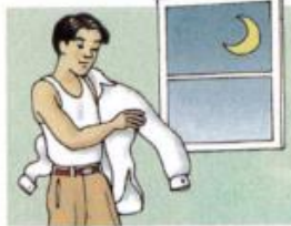
12. get undressed