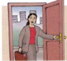
8. come home