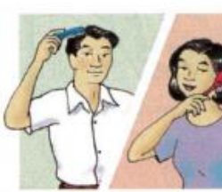
4. comb / brush my hair