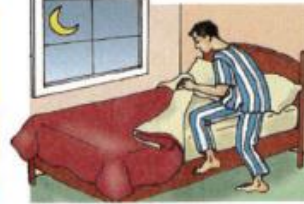
14. go to bed