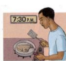
9. make dinner