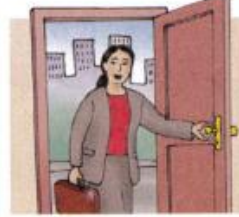
8. come home