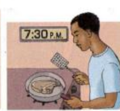
9. make dinner