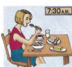
7. eat breakfast