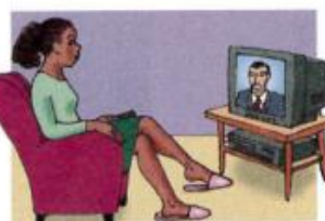
11. watch TV