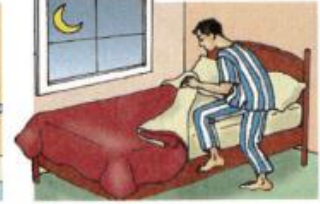
14. go to bed