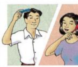
4. comb / brush my hair