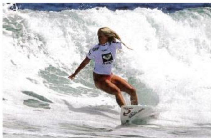
Hamilton was attacked by a tiger shark when she was thirteen.

In 2011, Hollywood made a movie about her experience. Bethany has a happy life and got married in 2013.