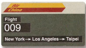
a direct flight