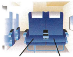
an aisle seat a window seat