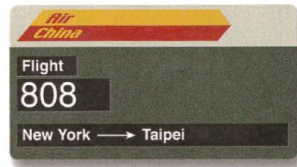
a non-stop flight