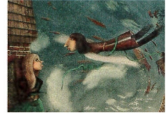
an animated film