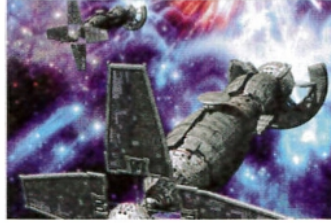
a science-fiction film