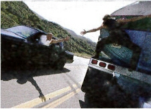
an action film