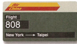
a non-stop flight