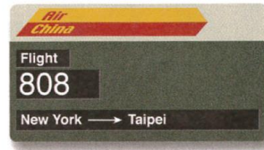
a non-stop flight