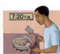
9. make dinner