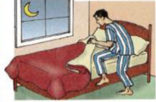
14. go to bed