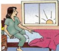
1. get up