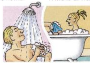
13. take a shower / a bath