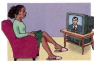
11. watch TV