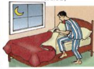
14. go to bed