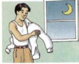
12. get undressed