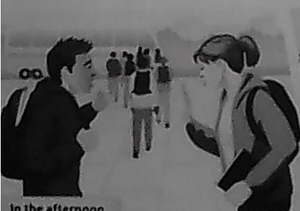
In the afternoon