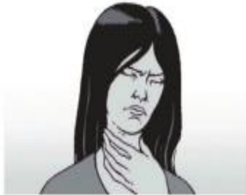
2. She has a sore throat