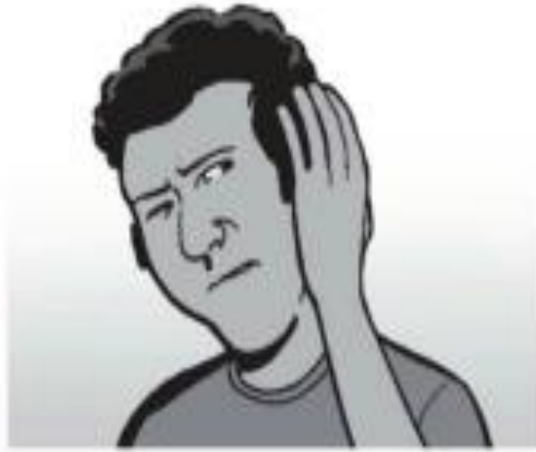
1. He has an earache