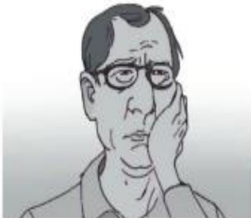
5. He has a toothache.