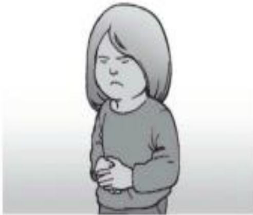
3. The girl has a stomachache