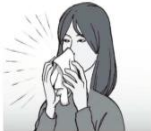
6. She has a cold.