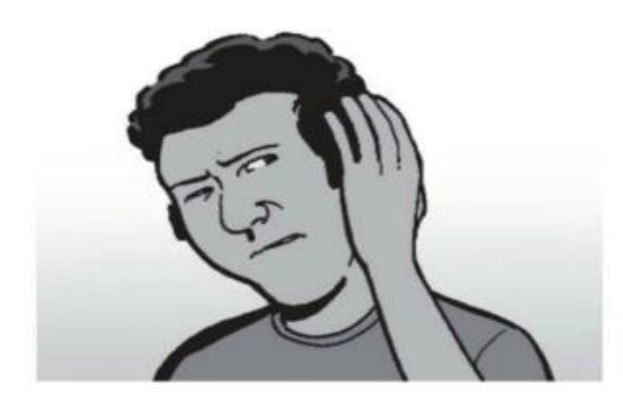
1. He has an earache.