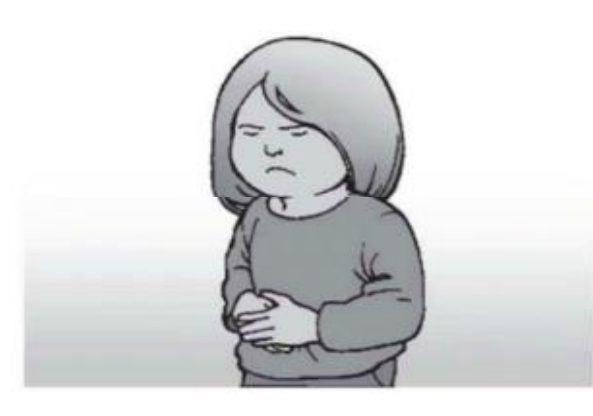
She has a Stomachache.