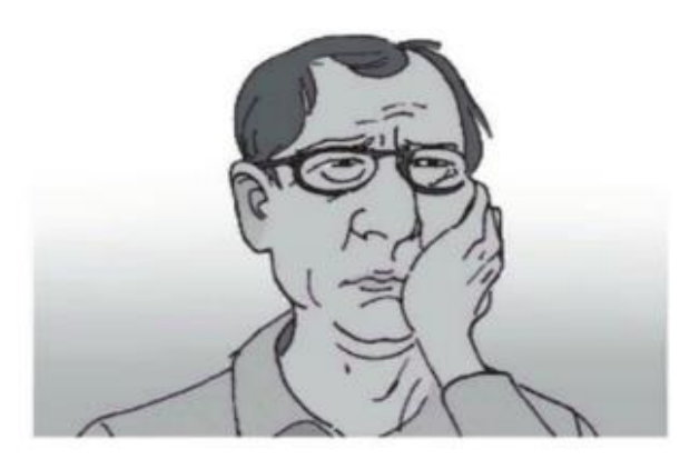
5. He has a Toothache.