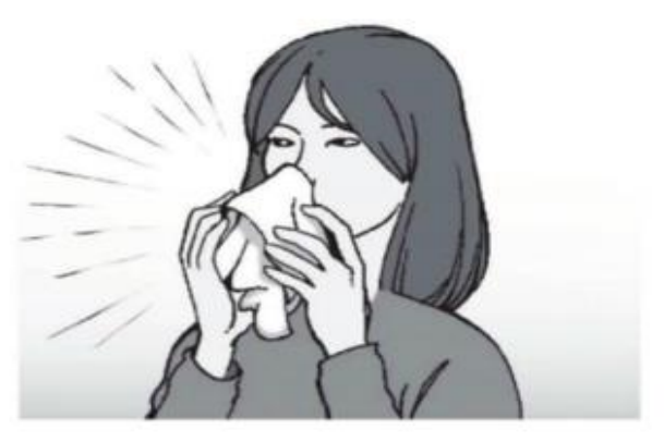
She has a Cold.