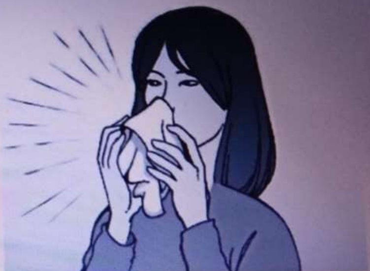
6. She has a cold