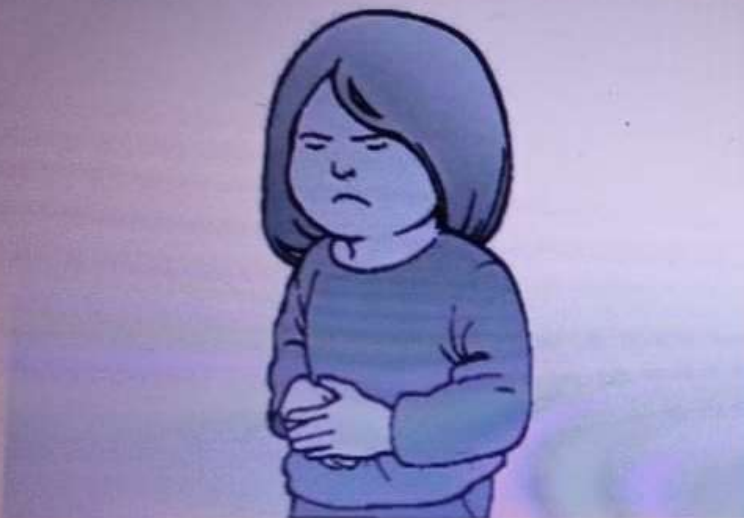
3. She has a stomachache