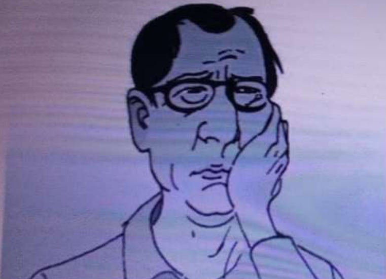
5. He has a toothache