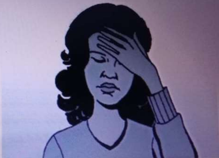
4. She has a headache