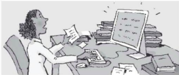
1. Don't work too hard