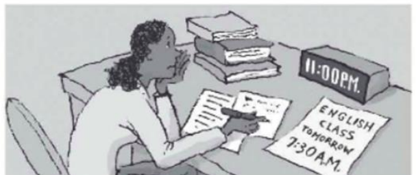
6. Don't stay up late