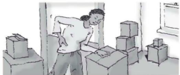
4. Don't lift heavy things