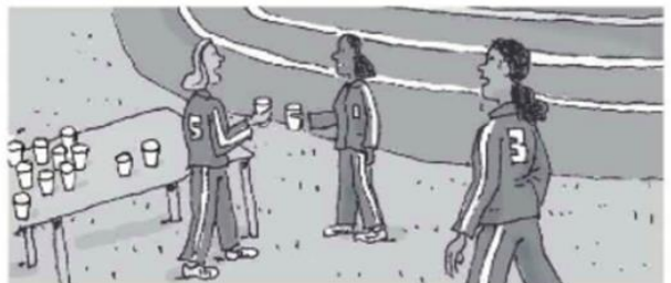
8. You should drink some water