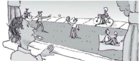
2. Don't go outside