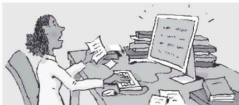
1. Don't work too hard.