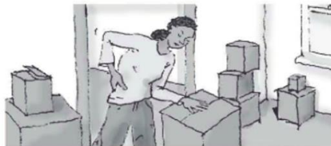
4. Don't lift heavy things