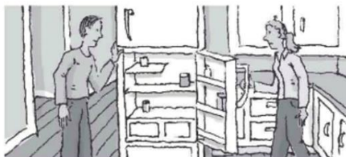
7. Go to the grocery store