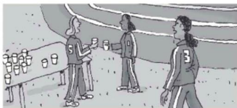
8. Drink some water