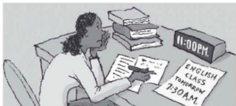
6. Don't stay up late