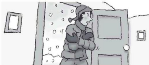
3. Have a hot drink