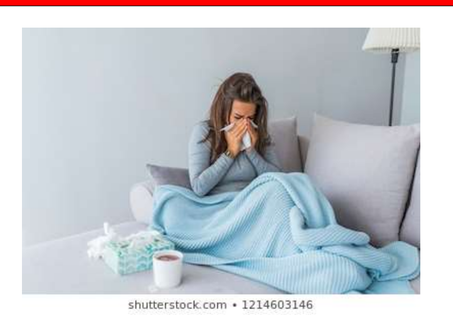
She has the flu