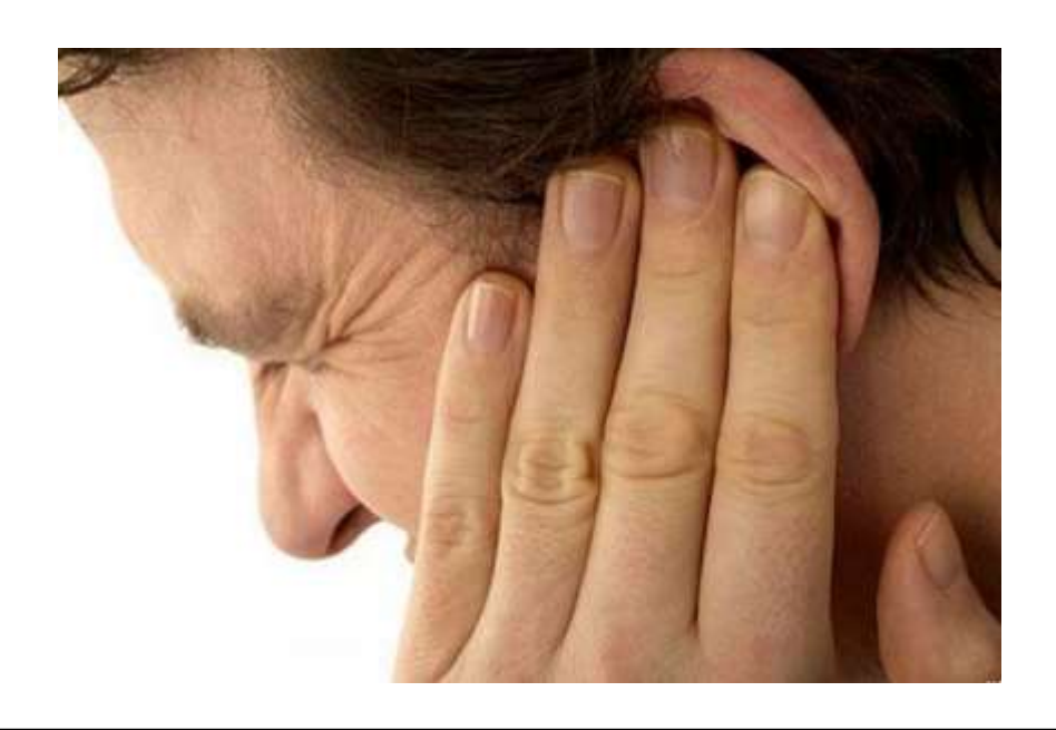
He has earache