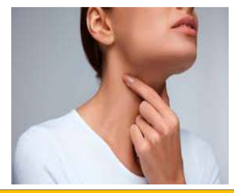
She has a sore throat