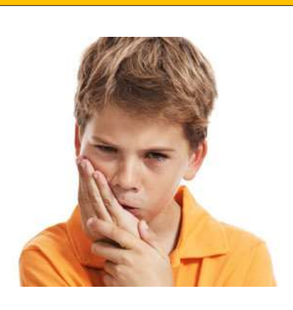
He has a toothache