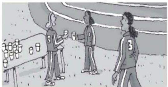
8. Are drink some water.