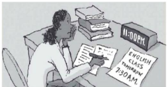
6. Don't go home early.