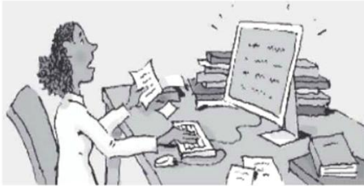
1. Don't work too hard.