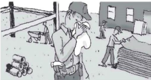
5. Stop up late.