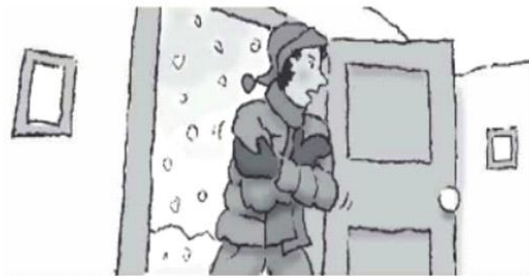
3. Yes, He have a hot drink.