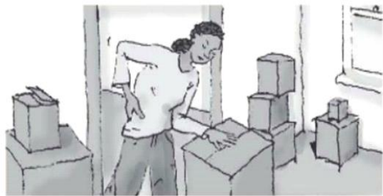
4. Lift heavy things.