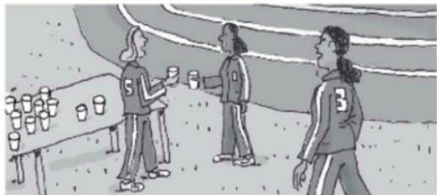
8. Drink some water