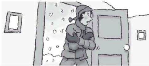
3. Have a hot drink