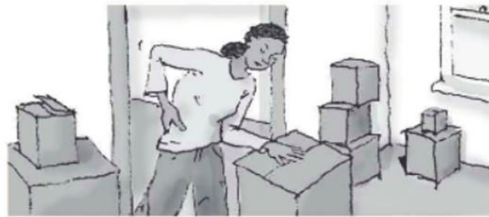
4. Lift heavy things