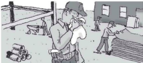
5. Stay up late