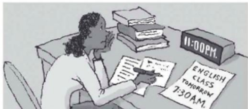
6. Go home early