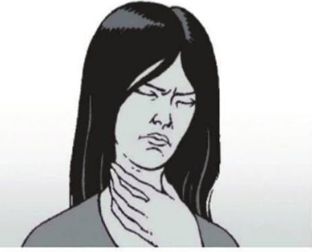
She has a sore throat