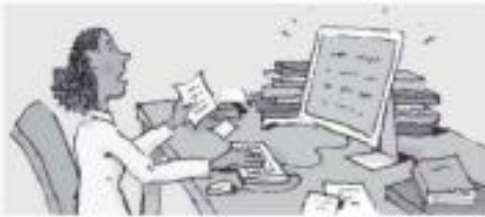
1. Don't work too hard.