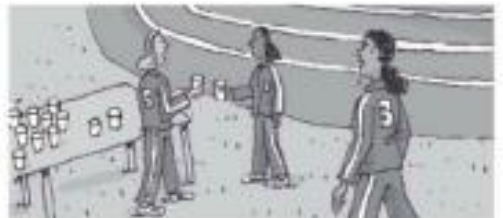
8. drink some water