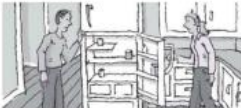
7. go to the grocery store