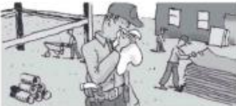
5. go home early