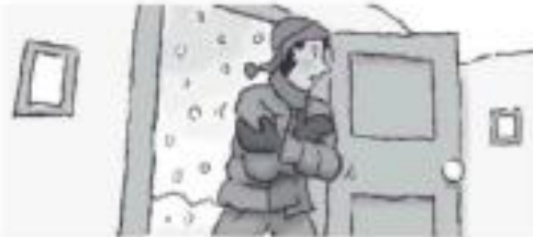
3. Don't go outside