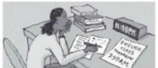
6. Don't stay up late