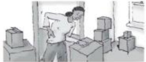
4. Don't lift heavy things