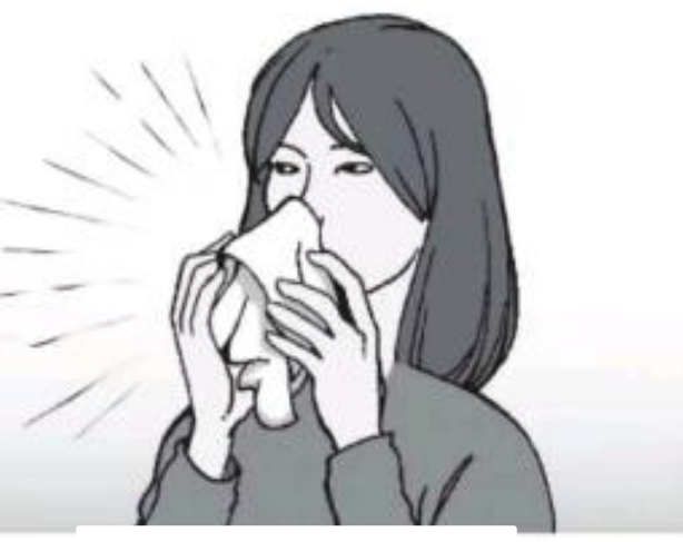
She has a cold