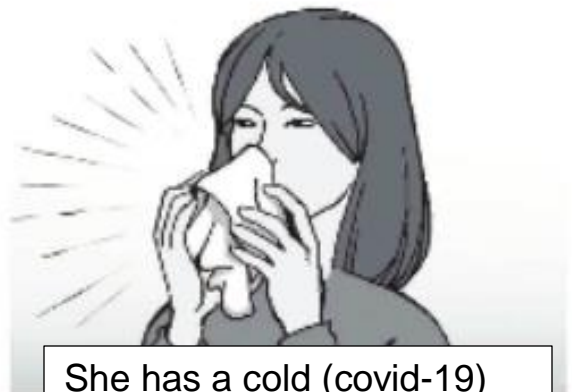
She has a cold (covid-19)