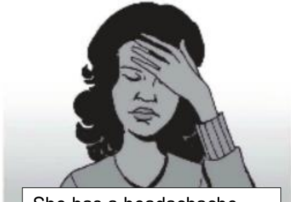
She has a headache