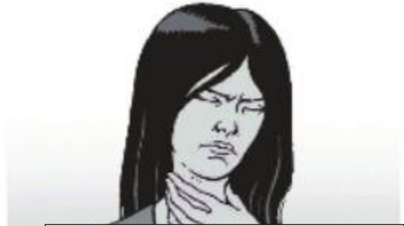
She has a sore throat