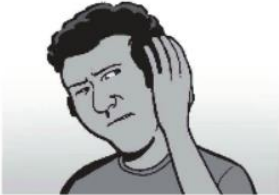
1. He has an earache.