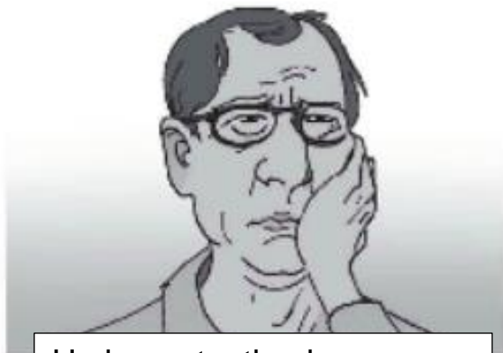
He has a toothache