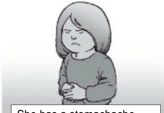
She has a stomachache