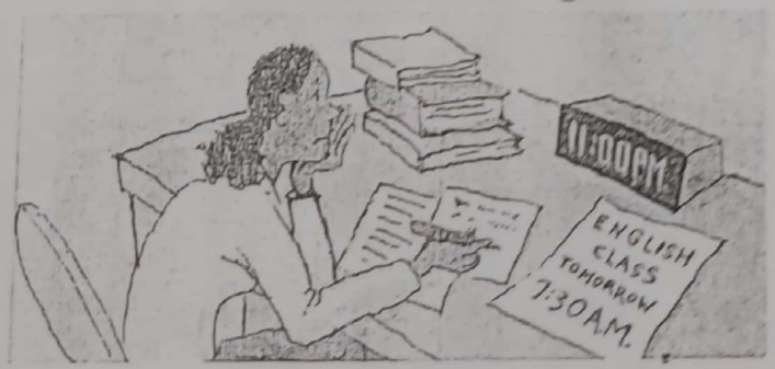
6. she should not stay up late.