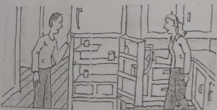
7. They should go to the grocery store.