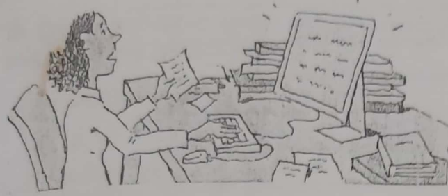
1. Don't work too hard.