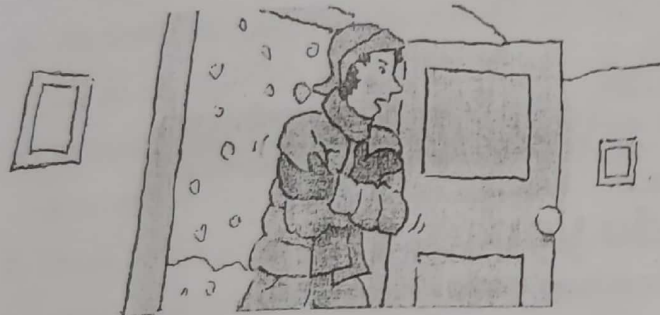
3. you should have a hot drink.