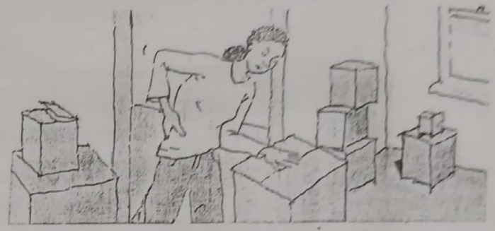
4. she should not lift heavy things.