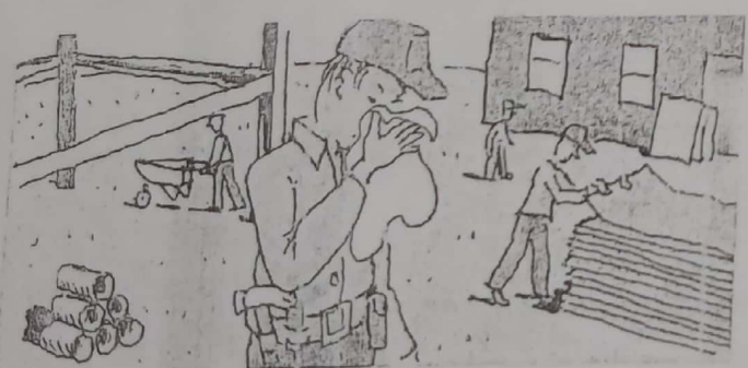
5. He should go home early.