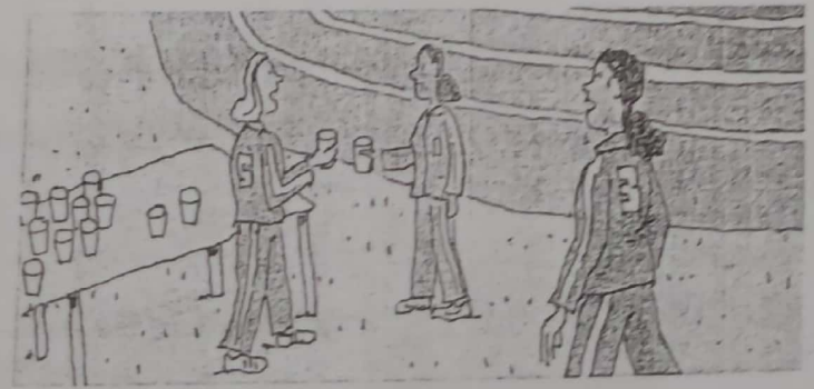
8. They should drink some water.