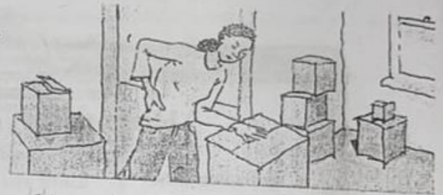
4. She should not lift heavy things