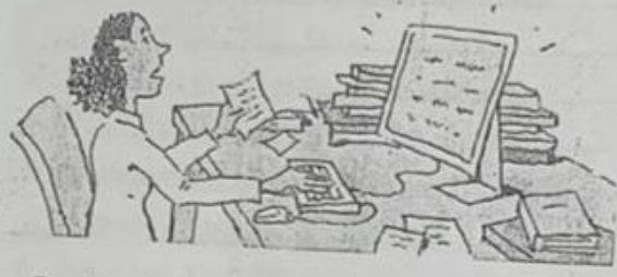
1. Don't work too hard.