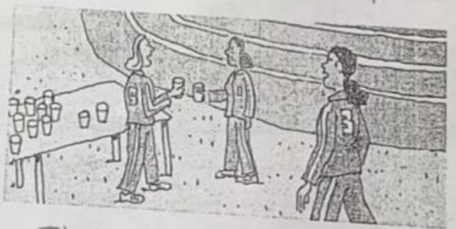
8. They should drink some water