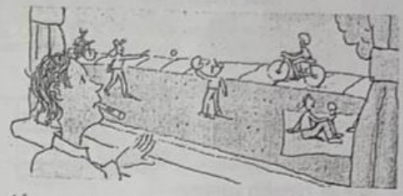
2. You should not go outside