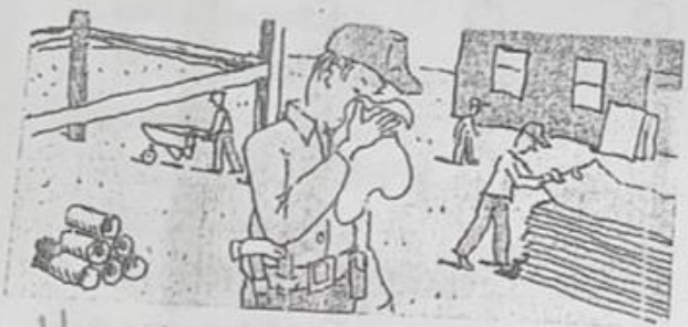
5. He should go home early