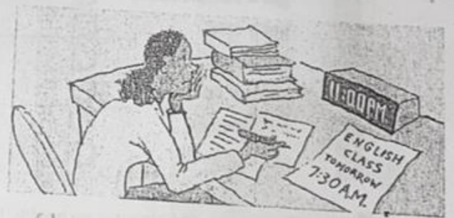
6. She should not stay up late