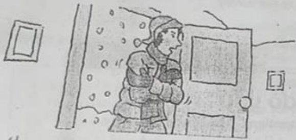
3. You should have a hot drink