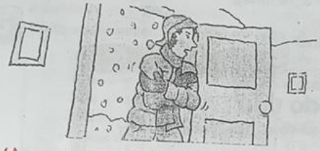
3. You should have a hot drink.