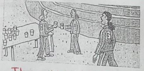
8. They should drink some water.