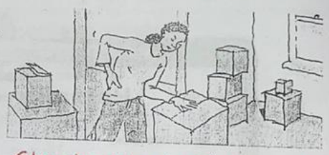
4. She should not lift heavy things.