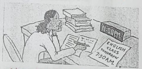
6. She should not stay up late.