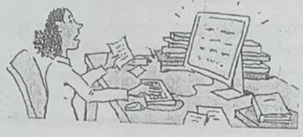
1. Don't work too hard.