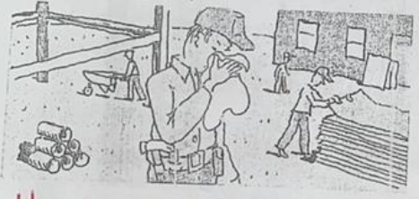
5. He should go home early.