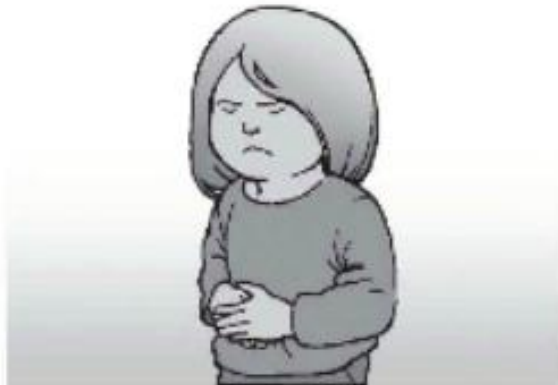
3. She has a stomachache