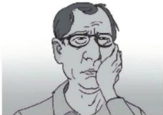
5. She has a toothache