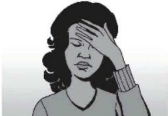
4. She has a headache