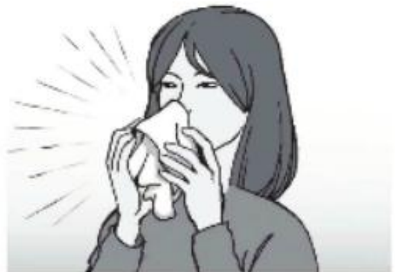
6. She has a flu