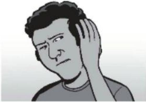
1. He has an earache.