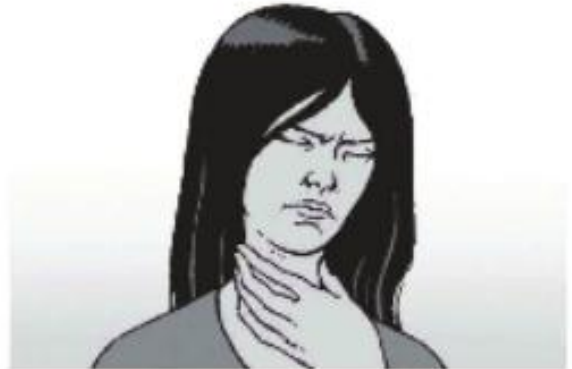
2. She has a sore throat