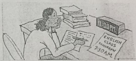
6. You should go home early