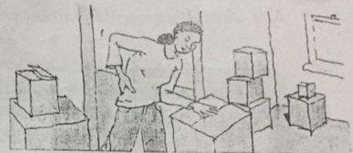
4. You should not lift heavy things