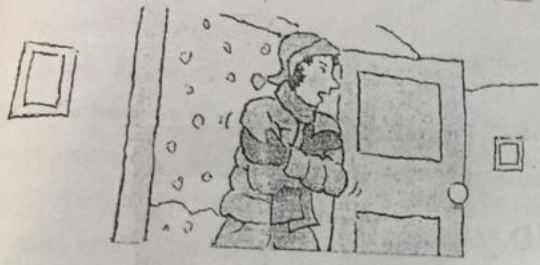
3. You should take a hot drink