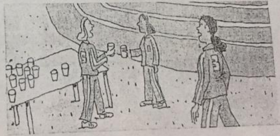
8. You should drink some water