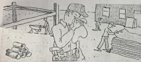
5. You should stay up late