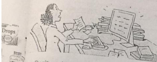
1. Don't work too hard.