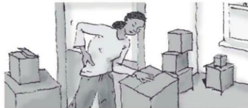
4. Lift heavy things