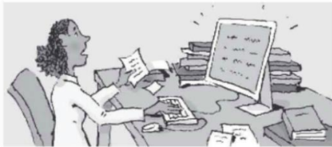
1. Don't work too hard.