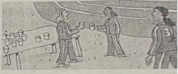
8. You should drink some water