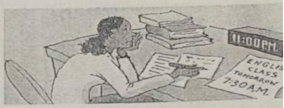
6. You should not stay up late