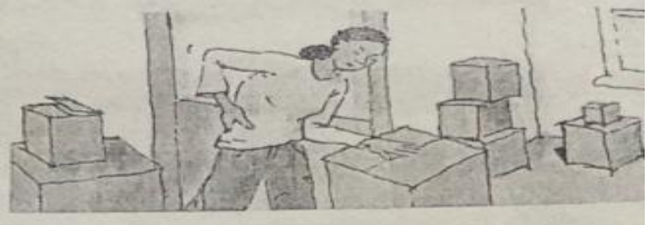
4. You should don't heavy things