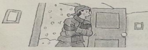
3. You should have a hot drink