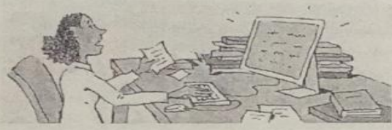
1. Don't work too hard.