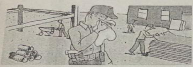
5. You should go home early