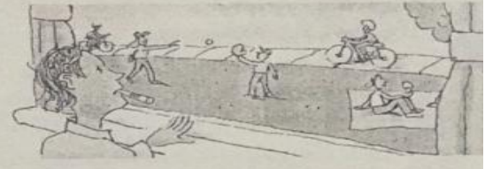
2. You shouldn't go outside