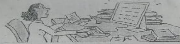
1. Don't work too hard.