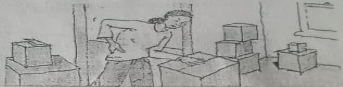
4. Don't lift heavy things