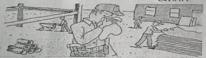
5. You should go home early