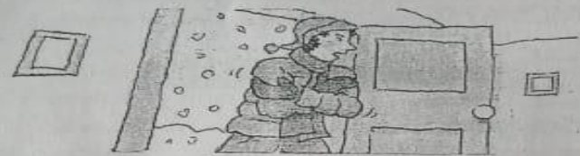
3. You should have a hot drink