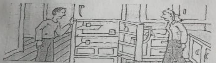
7. You should go to the grocery store