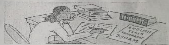
6. You should not up late