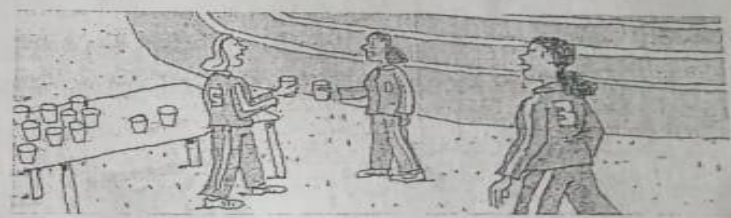
8. You should drink some water