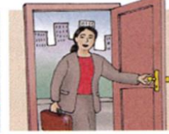
8. come home