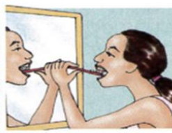
3. brush my teeth