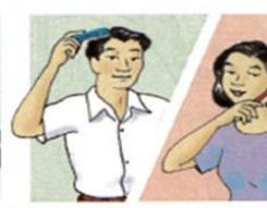
4. comb / brush my hair