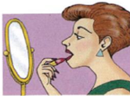
6. put on makeup