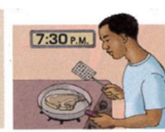
9. make dinner