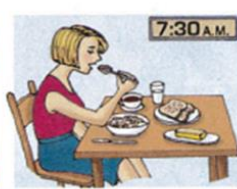
7. eat breakfast