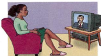
11. watch TV