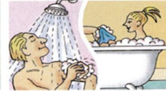
13. take a shower / a bath