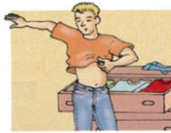
2. get dressed