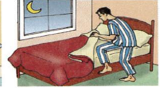
14. go to bed