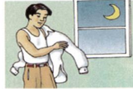
12. get undressed