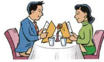
7. go out for dinner