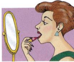
6. put on makeup