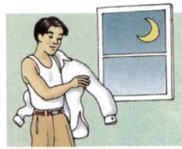
12. get undressed