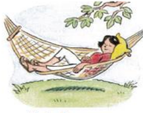
2. take a nap