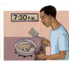
9. make dinner