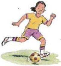
5. play soccer