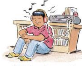
3. listen to music