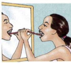
3. brush my teeth