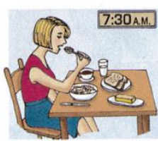
7. eat breakfast