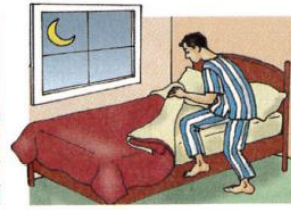
14. go to bed