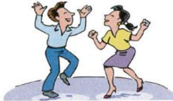
9. go dancing