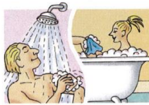
13. take a shower / a bath