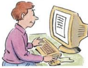
6. check e-mail