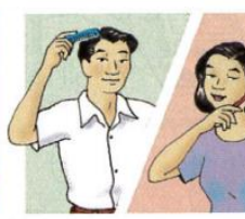
4. comb / brush my hair