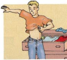
2. get dressed