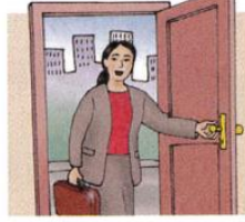
8. come home