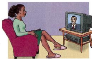
11. watch TV