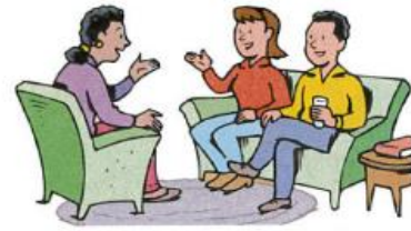
10. visit friends