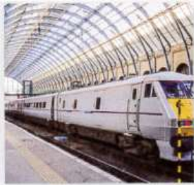
2. a train station