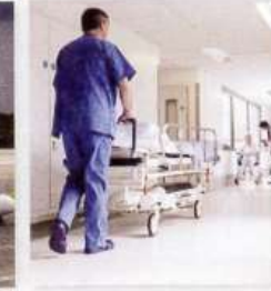
8. a hospital