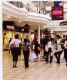
5. a mall