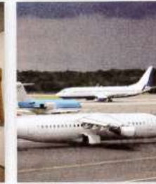
7. an airport