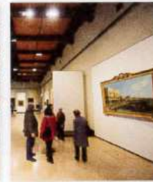
6. a museum