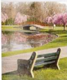
4. a park