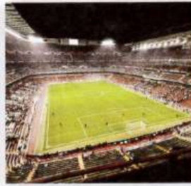
3. a stadium