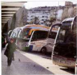
1. a bus station

Escribe 6 preguntas con sus repuestas usando "Where" y el vocabulario debajo.