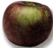
3. an apple