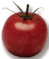
7. a tomato