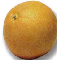
4. an orange