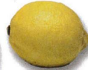
5. a lemon