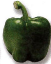
9. a pepper