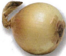
2. an onion