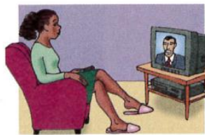
11. watch TV