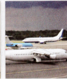
7. an airport