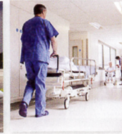
8. a hospital

1. where is the bus station? Just around the corner