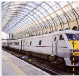
2. a train station