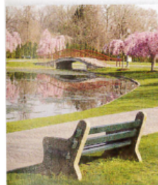
4. a park