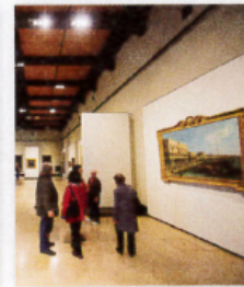
6. a museum