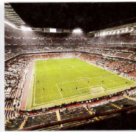
3. a stadium