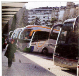
1. a bus station

Escribe 6 preguntas con sus repuestas usando "Where" y el vocabulario debajo.