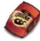
5. a bag of onions.

B) Complete each question with “how much” or “how many” / Completa cada pregunta con “how much” o “how many”