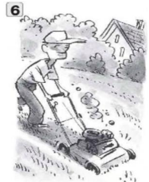
work in the yard