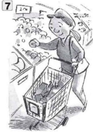
shop for groceries