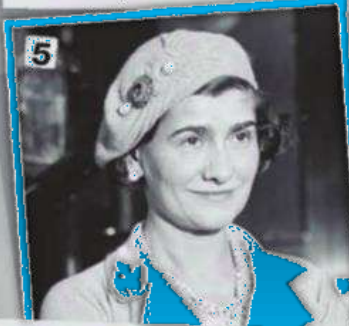
5 Coco Chanel, fashion designer 1883–1971 ▶ born in France ▶ opened her first shop in Paris, 1909