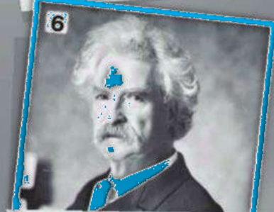
6 Mark Twain, writer 1835–1910 ▶ born in the U.S. ▶ wrote The Adventures of Huckleberry Finn , 1885