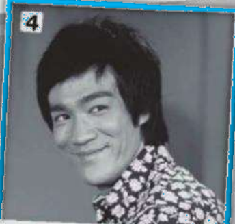
4 Bruce Lee, actor 1940–1973 ▶ born in the U.S. ▶ was in the movie Enter the Dragon , 1973