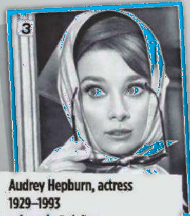
3 Audrey Hepburn, actress 1929–1993 ▶ born in Belgium ▶ was in the movie Breakfast at Tiffany's , 1961