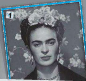
1 Frida Kahlo, painter 1907–1954 ▶ born in Mexico ▶ married painter Diego Rivera, 1929