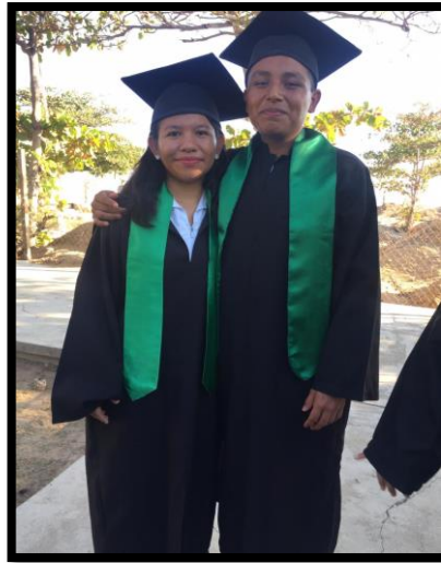
I graduated from preparatory school

Yo y mi amiga cuando iba a la preparatoria