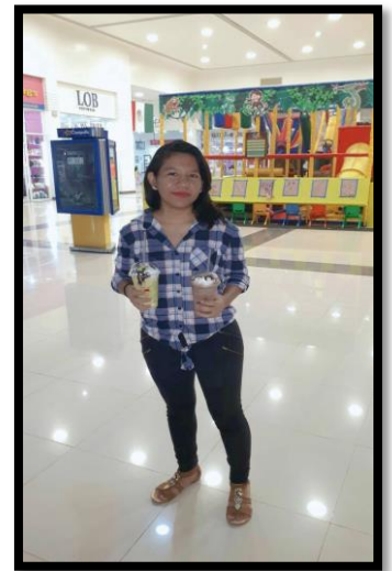
I at 19 years old