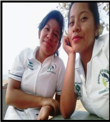
I and my friend when i went to preparatory school.

Yo y mi amiga cuando iba a la preparatoria