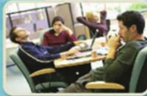
go to meetings