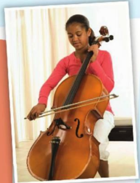
play a musical instrument