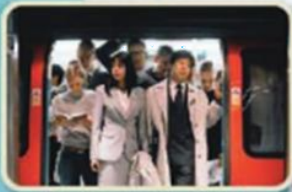
travel to work