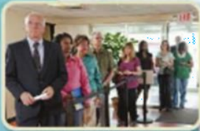
stand in line