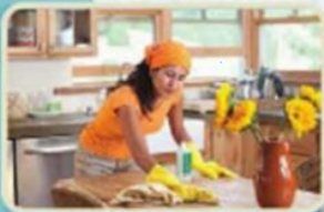
clean the house