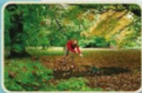
work in the yard