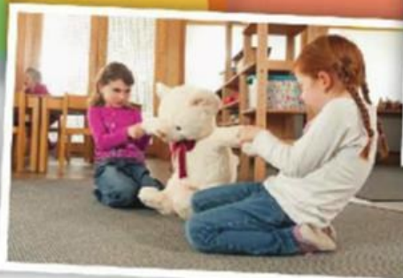
argue with your friends

B GROUP WORK Join another pair. Tell them about changes in your partner's life.