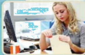
open the mail