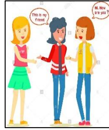
Go out with my friends Salir con mis amigas