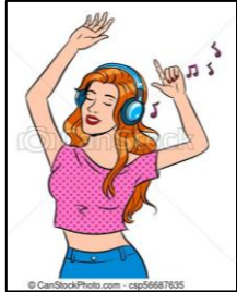
Listen to music Escuchar música