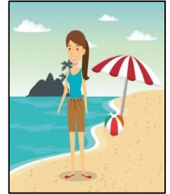
Go to the beach Ir a la playa