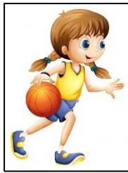
Play basketball Jugar basquetbol