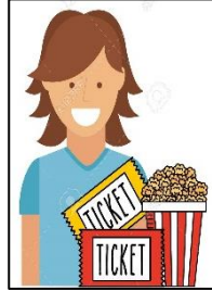
Go to the movies Ir al cine