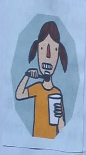
She is brushing her teeth