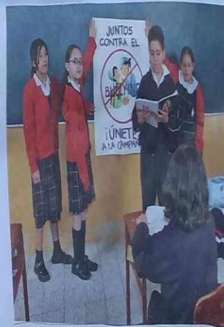
Working as a team