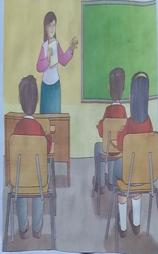
There at school.