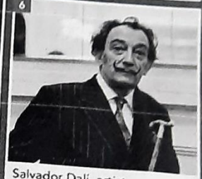
Salvador Dalí, artist (1904-1989) • born in Spain • painted The Persistence of Memory, 1931