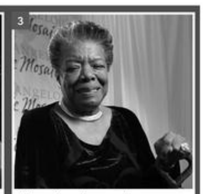
Maya Angelou, author (1928–2014)