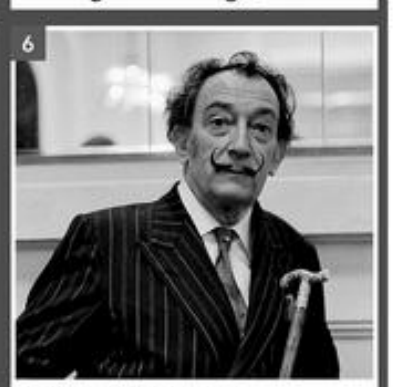
Salvador Dalí, artist (1904–1989)